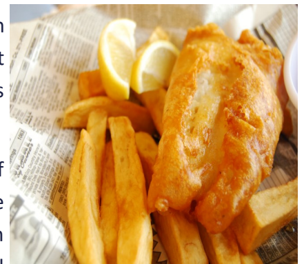
Figure 3. Fish and chips, the long-loved staple of British cuisine (source: R&B)

Those going on a holiday around the South of England will find it hard to resist the temptation of ordering the classic dish of fish and chips in a family pub in a small coastal village after travel restrictions are lifted.