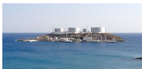
Figure 5. Kali Limenes

Figure 4 shows that Kali Limenes is not for those on a tight budget but can be helpful if a non-scrubber vessel critically needs bunkers or is heading towards the Suez Canal, which does not offer VLSFO yet.