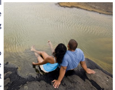
Figure 2. A happy couple in Pitch Lake

Those who holiday in Trinidad, which also produces one of the hottest chillies in the world, can visit Pitch Lake, the largest natural deposit of asphalt and a popular tourist spot, the size of 80 football pitches holding 10 millions tons of asphalt.